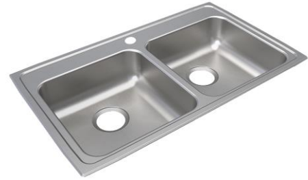
Shown with one-hole configuration. Other configurations available.

Cutout Dimensions for Drop-in Installation: 36-5/8" x 16-3/8" (930mm x 416mm) with 1-1/2" (38mm) corner radius