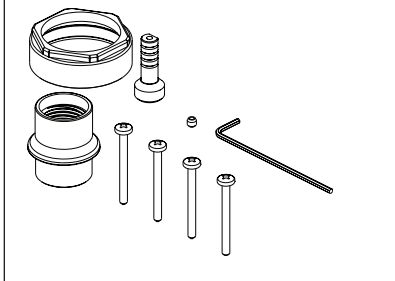
▲ Designate Proper Finish Suffix